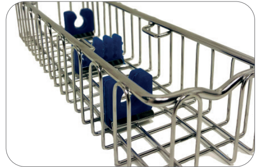
Robust stainless steel construction