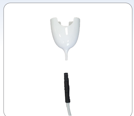
06000 | EAR RINSE CUP WITH CONNECTION FOR SUCTION HOSE