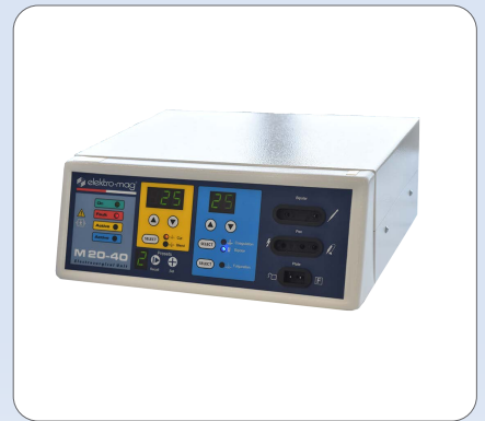
M20-40T | Elektro- Mag M20-40