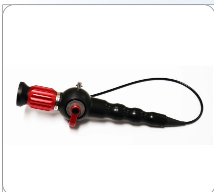
700828E PAEDIATRIC 700800E ADULT | FLEXIBLE NASO- PHARYNGO LARYNGOSCOPE