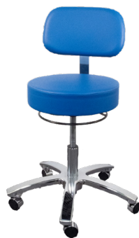
756000 ES | REGULAR DOCTOR'S STOOL