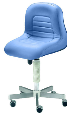
753000 ES | UNIVERSUM BUCKET STOOL

Don't let your equipment hinder your performance