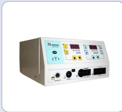
ESG-10-10-13 | ENTERWAVE MINI 4MHZ RADIO FREQUENCY GENERATOR