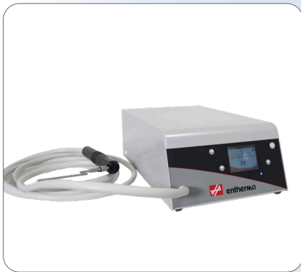
844080/III | ENTHERMO III