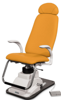
750108 | ENT PATIENT CHAIR