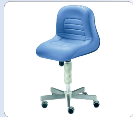
753000 ES | UNIVERSUM BUCKET STOOL

Don't let your equipment hinder your performance