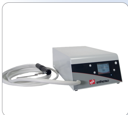
844080/III | ENTHERMO III