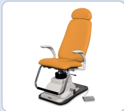
750108 | ENT PATIENT CHAIR