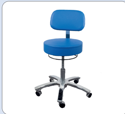
756000 ES | REGULAR DOCTOR'S STOOL