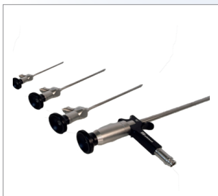
A RANGE OF RIGID ENT ENDOSCOPES