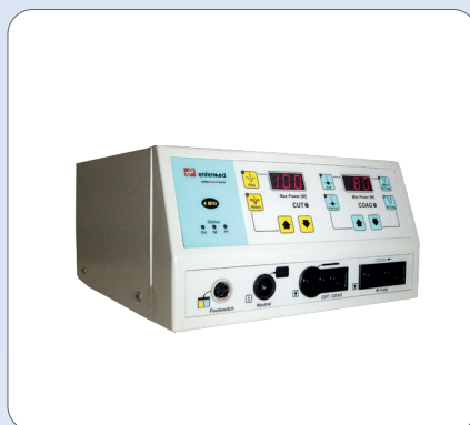
ESG-10-10-13 | ENTERWAVE MINI 4 RADIO FREQUENCY GENERATOR