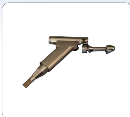
812655/812665 | POLITZER OLIVE 18 / 22 MM, FITS DIRECTLY INTO COMPRESSOR HANDPIECE