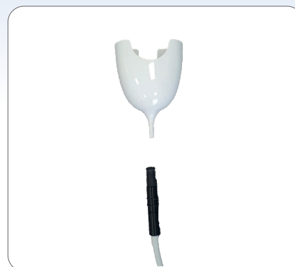
06000 | EAR RINSE CUP WITH CONNECTION FOR SUCTION HOSE